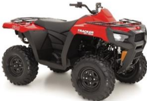
Recalled 2022 Tracker 600 All-Terrain Vehicle